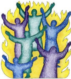
Pentecost - Acts 2

Many people will be surprised when Jesus comes again – but nobody will be mistaken. - Anon